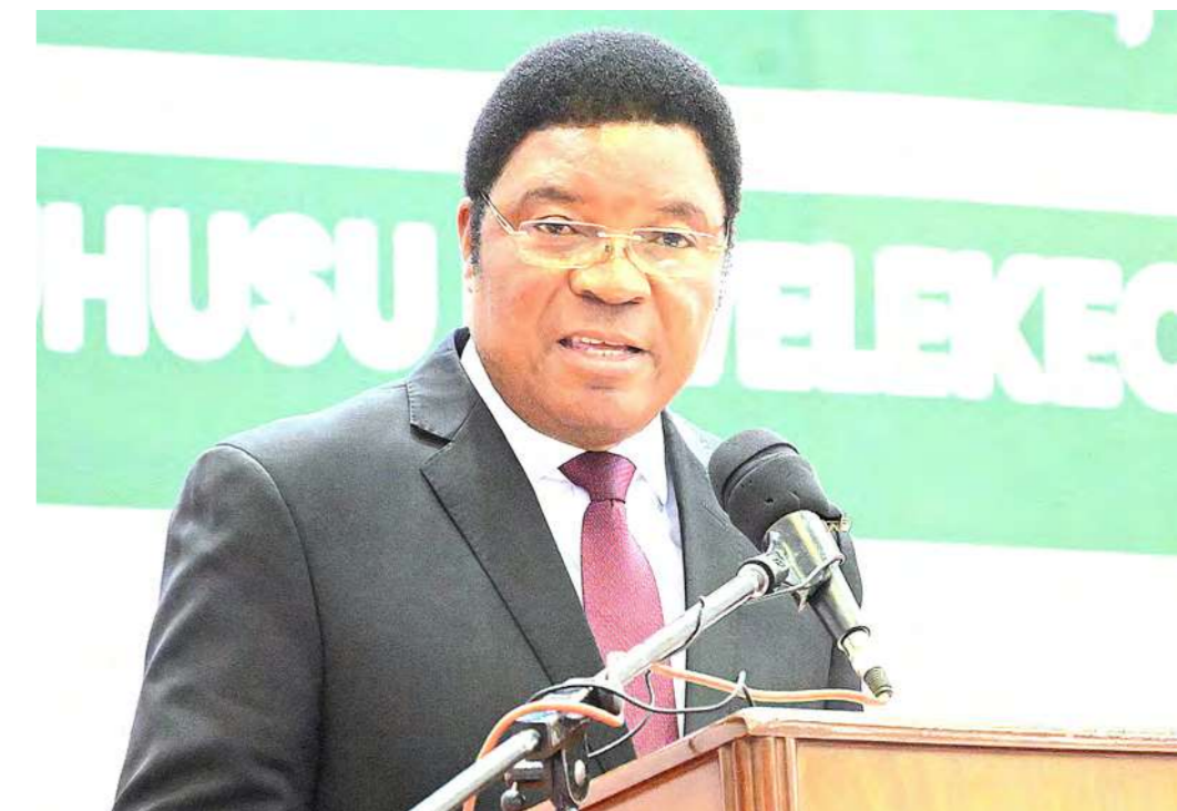
Prime Minister Kassim Majaliwa