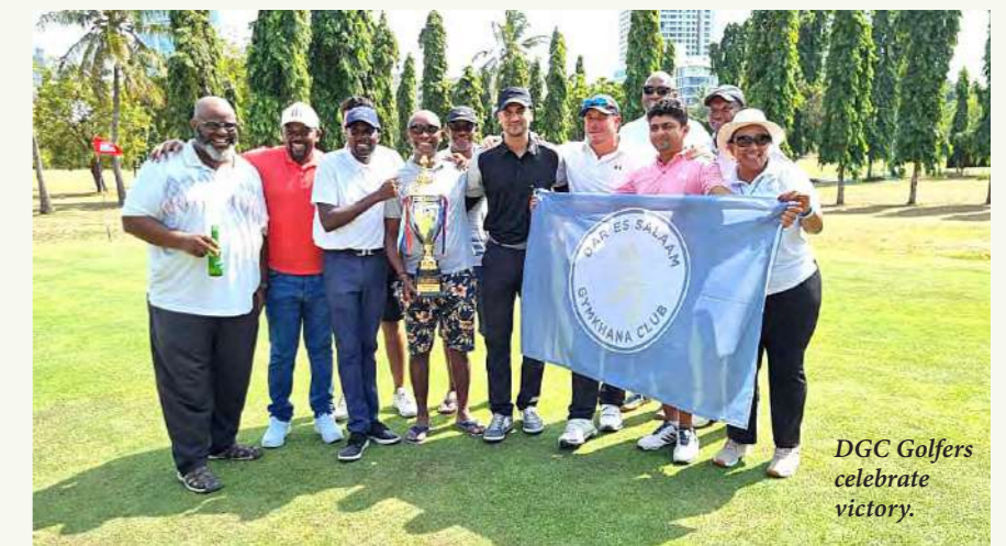
DGC Golfers celebrate victory.