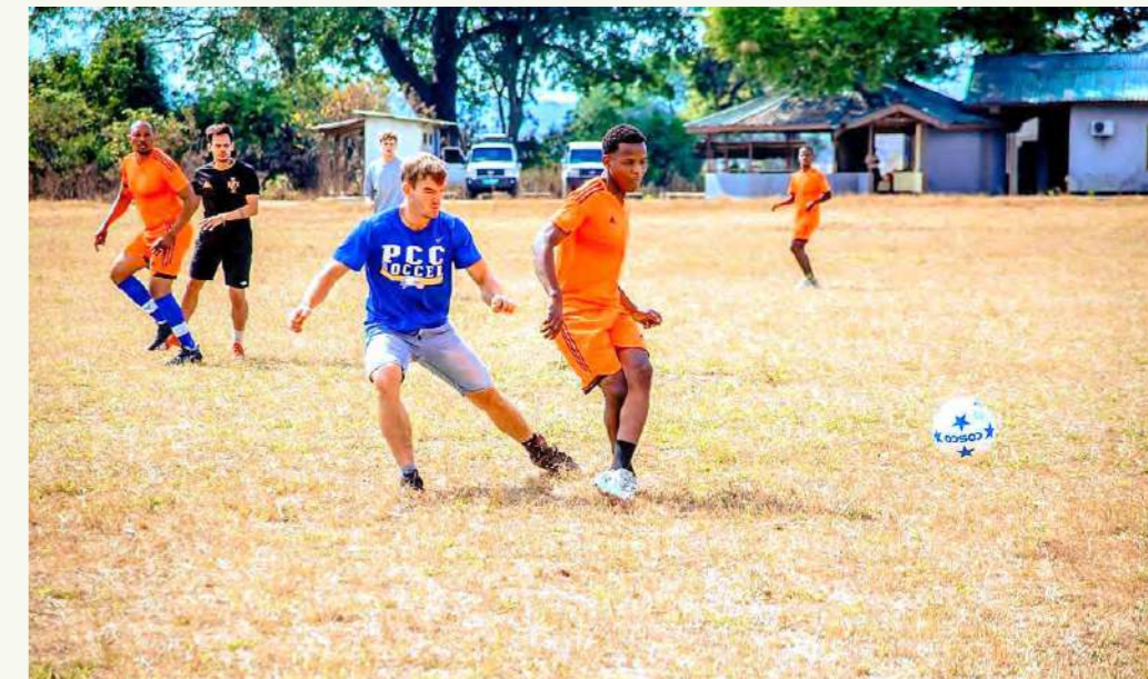
Pensacola Christian College Students, from the United States of America engaged in a football match inside the Mikumi National Park shortly after undertaking a game drive through during which they managed to see the big-four animals.

The event not only lifted spirits but also raised funds for the construction of