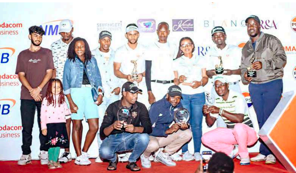
Tanzanian Open 2024 Winners