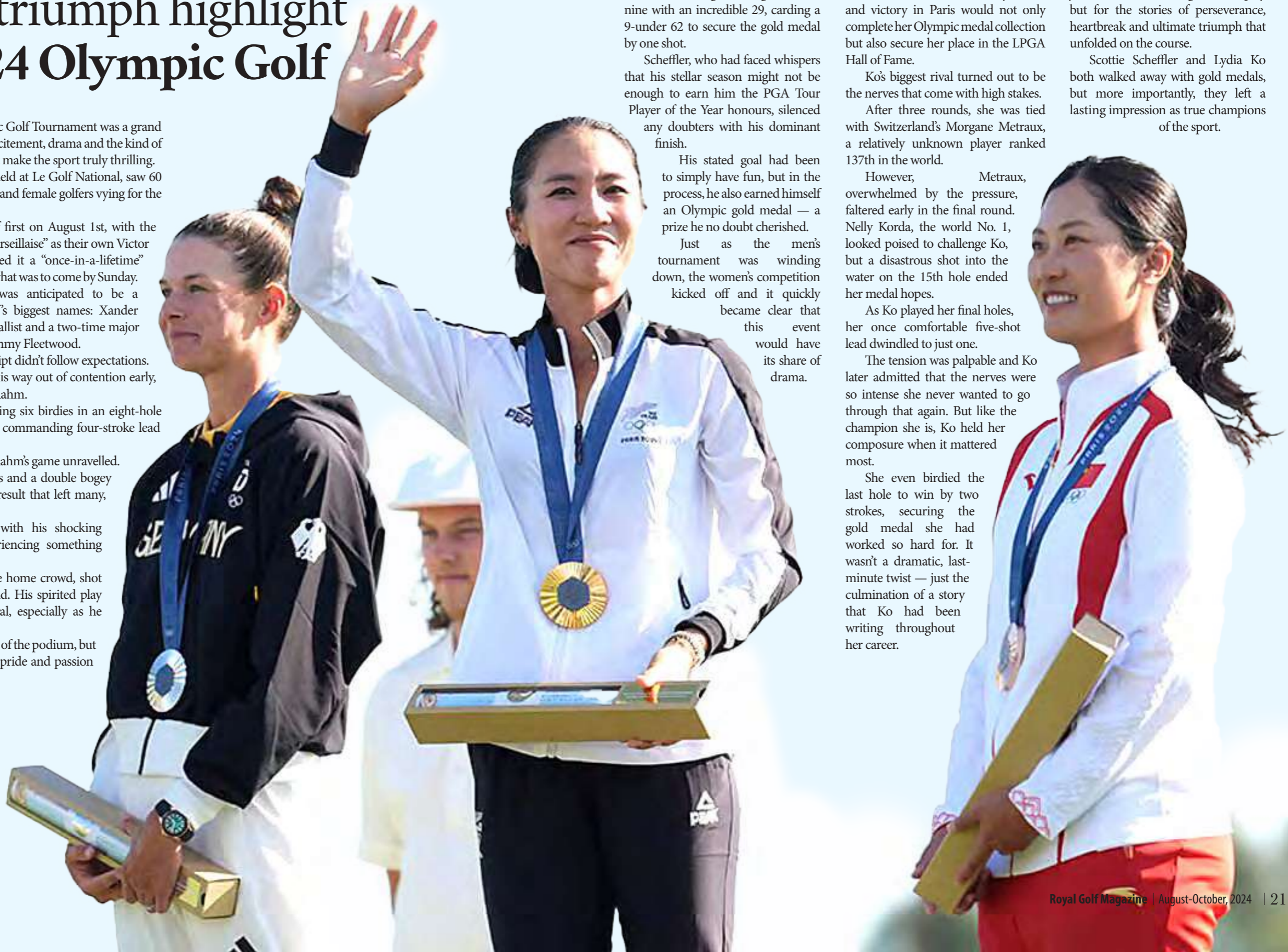
Lydia Ko, of New Zealand, (centre), waves to the crowd wearing her gold medal during the medal ceremony, with Esther Henseleit of Germany (left), silver medal and Xiyu Lin of China on the winners podium following the final round of the women's golf event at the 2024 Summer Olympics at Le Golf National, in Saint-Quentin-en-Yvelines, France.

Scottie Scheffler and Lydia Ko both walked away with gold medals, but more importantly, they left a lasting impression as true champions of the sport.